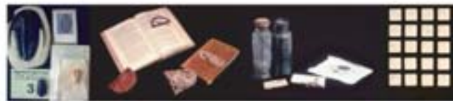
Graphic language inspired by the process and method of collecting