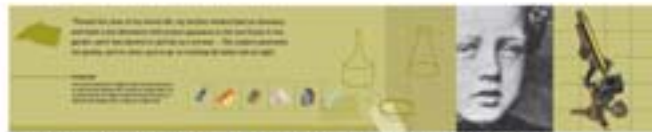
Open book pictogram to highlight diary inserts, graphic illustrations to support stories being told and key objects in showcases integrated into graphic band